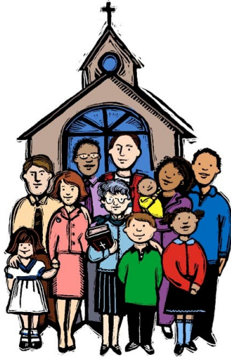
Our Church Family